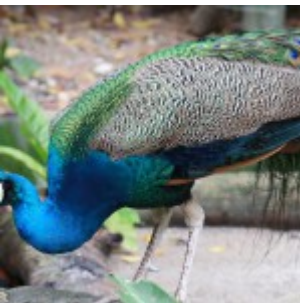
Sunway Lagoon Theme Park