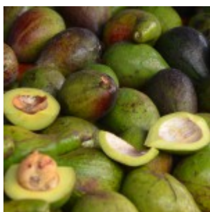
Kota Kinabalu Gaya Street