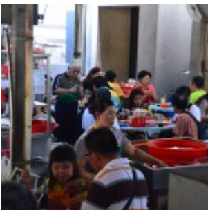
KL Petaling Heritage Food