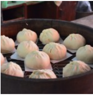
KL Petaling Heritage Food