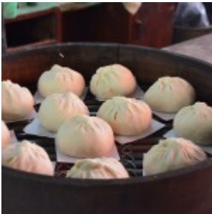
KL Petaling Heritage Food