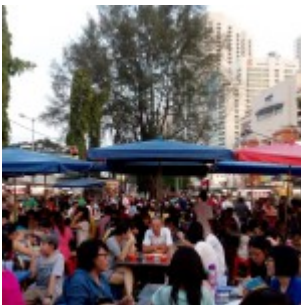
Gurney Drive Penang