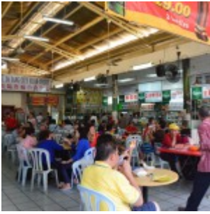
KL Petaling Heritage Food

Malaysia truly is a land of plenty. The country is endowed with beautiful beaches, invigorating highlands, verdant jungles teeming with flora and fauna, vibrant cities, charming countrysides and a spectrum of colourful cultures.