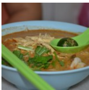
Kota Kinabalu Gaya Street