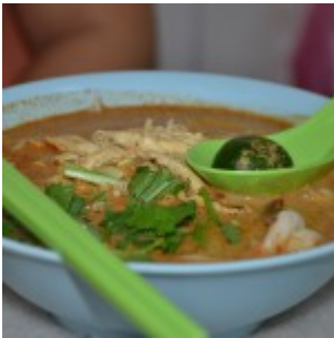
Kota Kinabalu Gaya Street