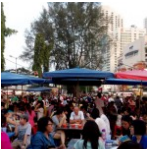
Gurney Drive Penang