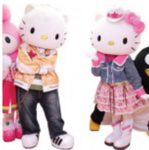
Sanrio Hello Kitty Town Johor Bahru