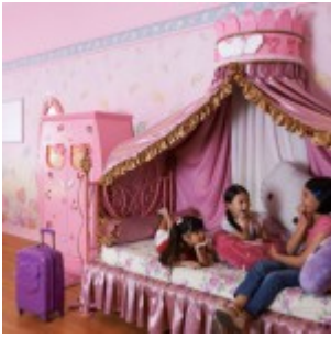
Sanrio Hello Kitty Town Johor Bahru