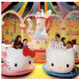
Sanrio Hello Kitty Town Johor Bahru