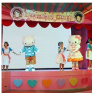
Sanrio Hello Kitty Town Johor Bahru