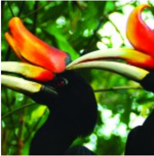
KL Bird Park