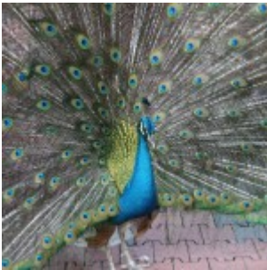
KL Bird Park