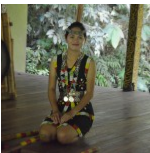
Mari Mari Cultural Centre

Mari Mari Cultural Village is located deep in the countryside approximately 25 minutes away from the modern and developing Kota Kinabalu city. The village operates as a museum that preserves Borneo ethnic culture to share the knowledge,