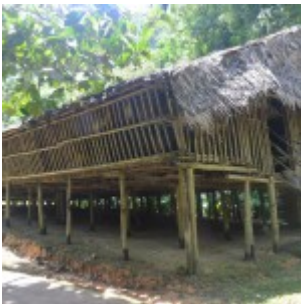
Mari Mari Cultural Centre