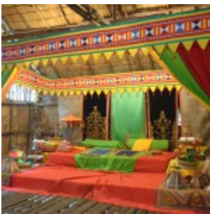
Mari Mari Cultural Centre