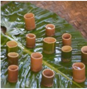
Mari Mari Cultural Centre