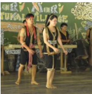
Mari Mari Cultural Centre