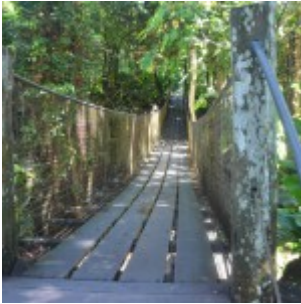
Mari Mari Cultural Centre