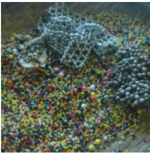
Mari Mari Cultural Centre