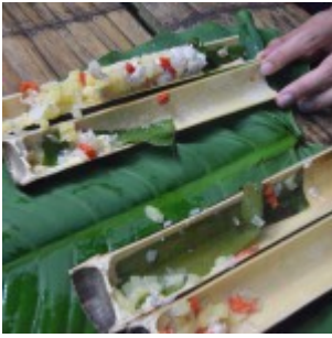
Mari Mari Cultural Centre