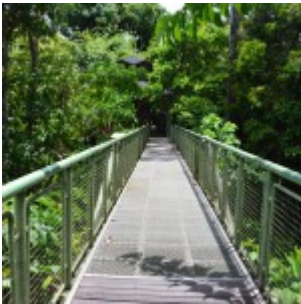
Rainforest Discovery Centre