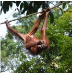
Sepilok Orang Utan Rehabilitation Centre

Enjoy the rare and thrilling opportunity to see an orang utan up close. Situated in the Kabili-Sepilok Forest Reserve which sprawls over 4,300ha, this sanctuary serves to rehabilitate orphaned orang utans as well as educate the public on the importance of wildlife conservation. The viewing gallery gives an opportunity to see the orang utans being fed by rangers.