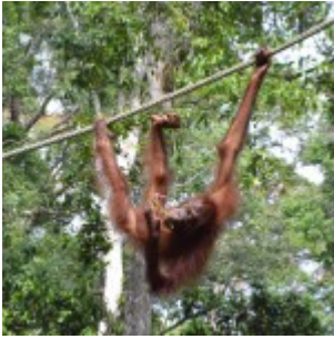
Sepilok Orang Utan Rehabilitation Centre