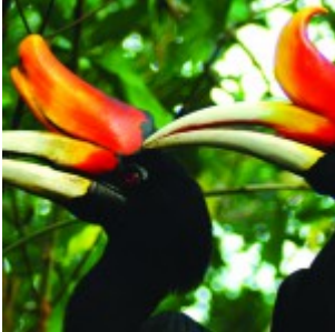
KL Bird Park