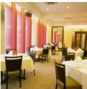
The Noble House Kuala Lumpur