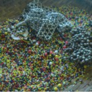
Mari Mari Cultural Centre