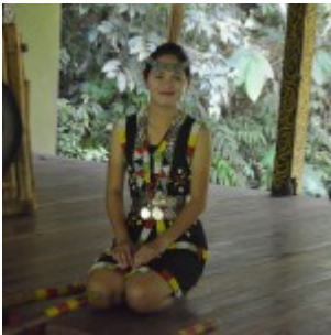
Mari Mari Cultural Centre

Mari Mari Cultural Village is located deep in the countryside approximately 25 minutes away from the modern and developing Kota Kinabalu city. The village operates as a museum that preserves Borneo ethnic culture to share the knowledge, history, culture, and tradition of Borneo.