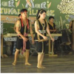
Mari Mari Cultural Centre