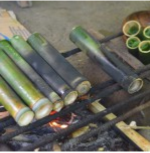
Mari Mari Cultural Centre