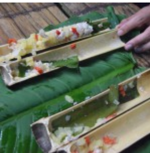
Mari Mari Cultural Centre