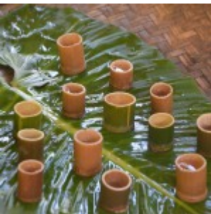
Mari Mari Cultural Centre