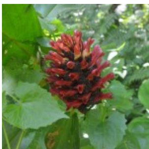
Mari Mari Cultural Centre