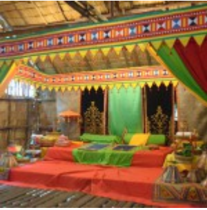
Mari Mari Cultural Centre