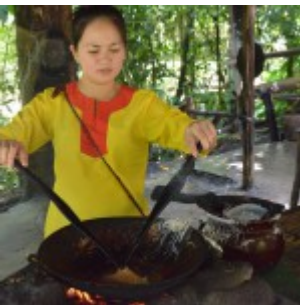
Mari Mari Cultural Centre