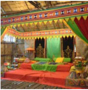
Mari Mari Cultural Centre