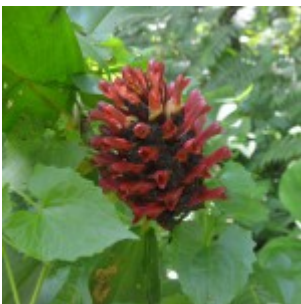
Mari Mari Cultural Centre