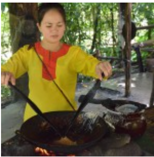
Mari Mari Cultural Centre