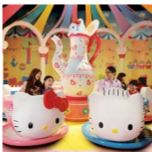
Sanrio Hello Kitty Town Johor Bahru