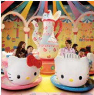
Sanrio Hello Kitty Town Johor Bahru