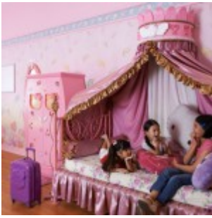
Sanrio Hello Kitty Town Johor Bahru