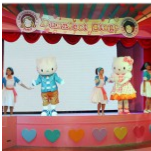
Sanrio Hello Kitty Town Johor Bahru