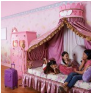
Sanrio Hello Kitty Town Johor Bahru