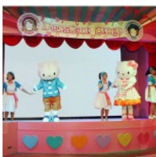
Sanrio Hello Kitty Town Johor Bahru