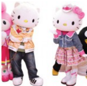
Sanrio Hello Kitty Town Johor Bahru