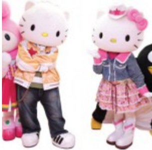
Sanrio Hello Kitty Town Johor Bahru