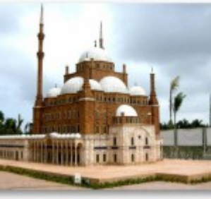
Islamic Civilisation Park

This unique theme park is a way to demonstrate the achievement of Islamic architecture. Besides, it provides an interactive journey of many famous Islamic monuments, including Taj Mahal of India, Al-Hambra Citadel of Spain and 3 others interactive monument. These 5 interactive monuments are among the other 21 mini replica monuments found in the Islamic Civilization Complex, separated from the Public Zone. Public zone houses the most impressive icon of the theme park, which is the Crystal Mosque.