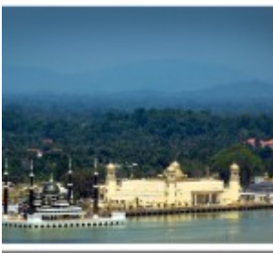
Islamic Civilisation Park