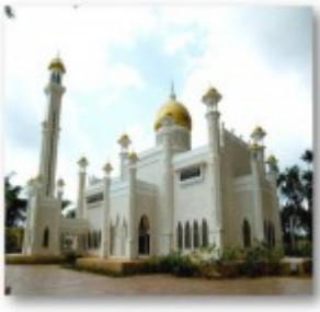
Islamic Civilisation Park