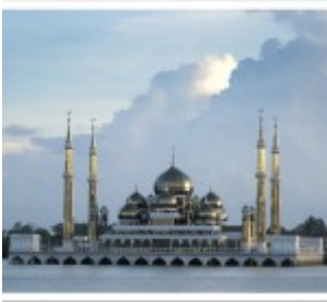
Islamic Civilisation Park