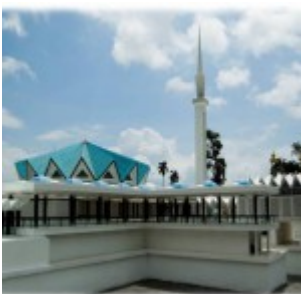
Islamic Civilisation Park