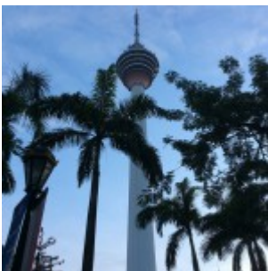
Menara Kuala Lumpur (Kuala Lumpur Tower)