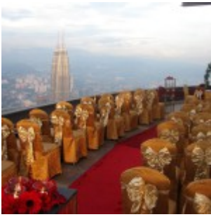
Menara Kuala Lumpur (Kuala Lumpur Tower)