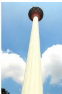
Menara Kuala Lumpur (Kuala Lumpur Tower)