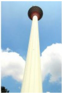
Menara Kuala Lumpur (Kuala Lumpur Tower)