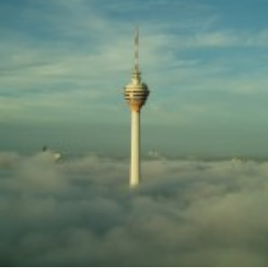
Menara Kuala Lumpur (Kuala Lumpur Tower)