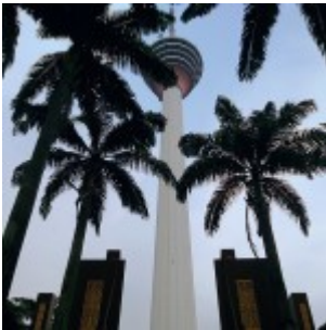
Menara Kuala Lumpur (Kuala Lumpur Tower)

MENARA KUALA LUMPUR (Kuala Lumpur Tower) is the seventh tallest telecommunication tower in the world and the tallest in Southeast Asia. Standing at 421m and located in the heart of Kuala Lumpur, we offer a unique blend of Cultural, Adventure and Nature experience not found anywhere else in the world.