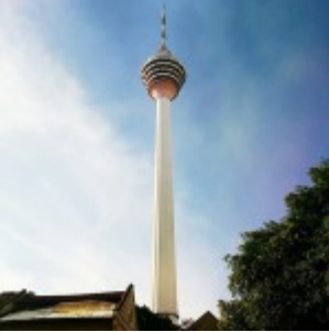
Menara Kuala Lumpur (Kuala Lumpur Tower)