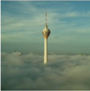
Menara Kuala Lumpur (Kuala Lumpur Tower)