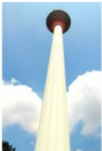
Menara Kuala Lumpur (Kuala Lumpur Tower)