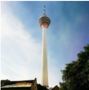
Menara Kuala Lumpur (Kuala Lumpur Tower)