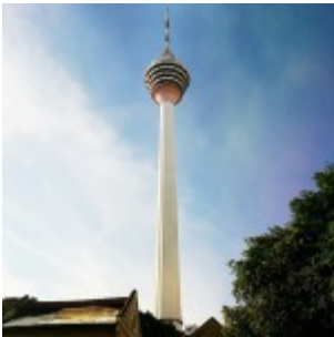
Menara Kuala Lumpur (Kuala Lumpur Tower)