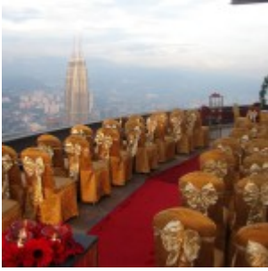
Menara Kuala Lumpur (Kuala Lumpur Tower)