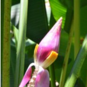
Rainforest Discovery Centre