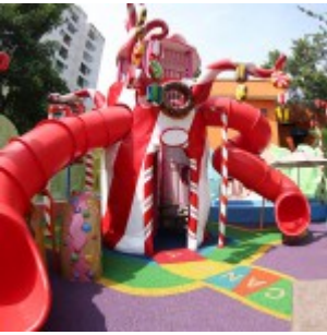
Sunway Lagoon Theme Park