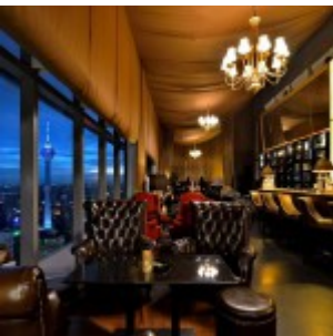
Marini's on 57