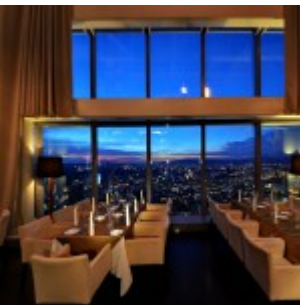
Marini's on 57