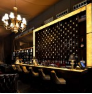
Marini's on 57

Marini's on 57 – Kuala Lumpur's highest rooftop bar, Italian restaurant and whiskey & cigar lounge; each offering its own unique flavour. As you experience one of the best views over Kuala Lumpur, start the evening with our signature cocktails or wind down for the day with our premium selection of whiskeys and wines, before heading to our award-winning Italian restaurant to elevate your senses.