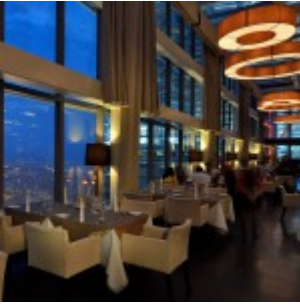
Marini's on 57