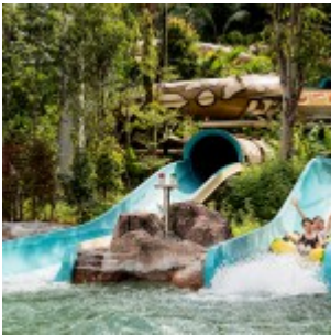
Sunway Lagoon Theme Park