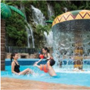
Sunway Lagoon Theme Park