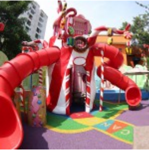
Sunway Lagoon Theme Park