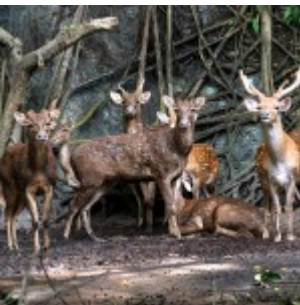
Sunway Lagoon Theme Park