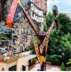
Sunway Lagoon Theme Park