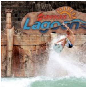
Sunway Lagoon Theme Park