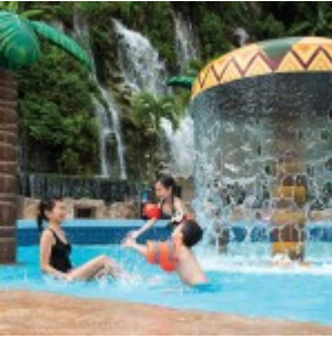
Sunway Lagoon Theme Park