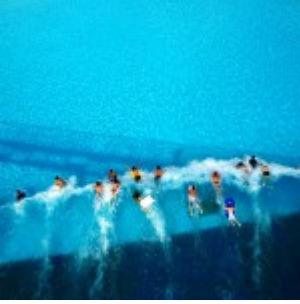
Sunway Lagoon Theme Park