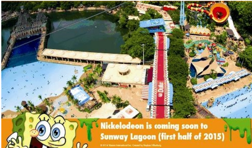
Nickelodeon Lost Lagoon

Sunway Group has expanded its strategic collaboration with Viacom International Media Networks (VIMN) Asia, to develop Nickelodeon Lost Lagoon at Sunway Lagoon. Nickelodeon Lost Lagoon will become the first Nickelodeon-themed land to be launched in Asia and is expected to open in Kuala Lumpur, Malaysia by mid-2015.