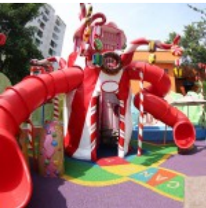
Sunway Lagoon Theme Park