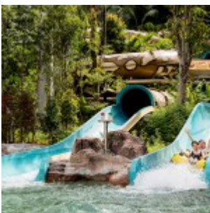
Sunway Lagoon Theme Park