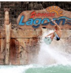
Sunway Lagoon Theme Park