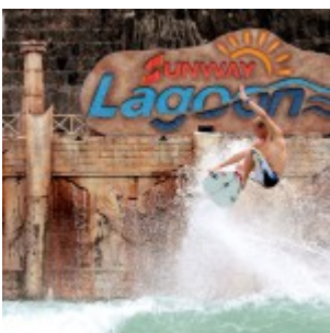
Sunway Lagoon Theme Park